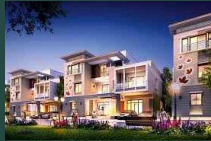
Dev's Istana Homes, Kukatpally.