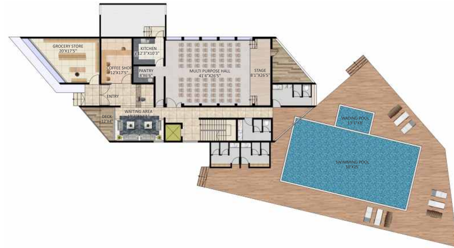
GROUND FLOOR PLAN 1